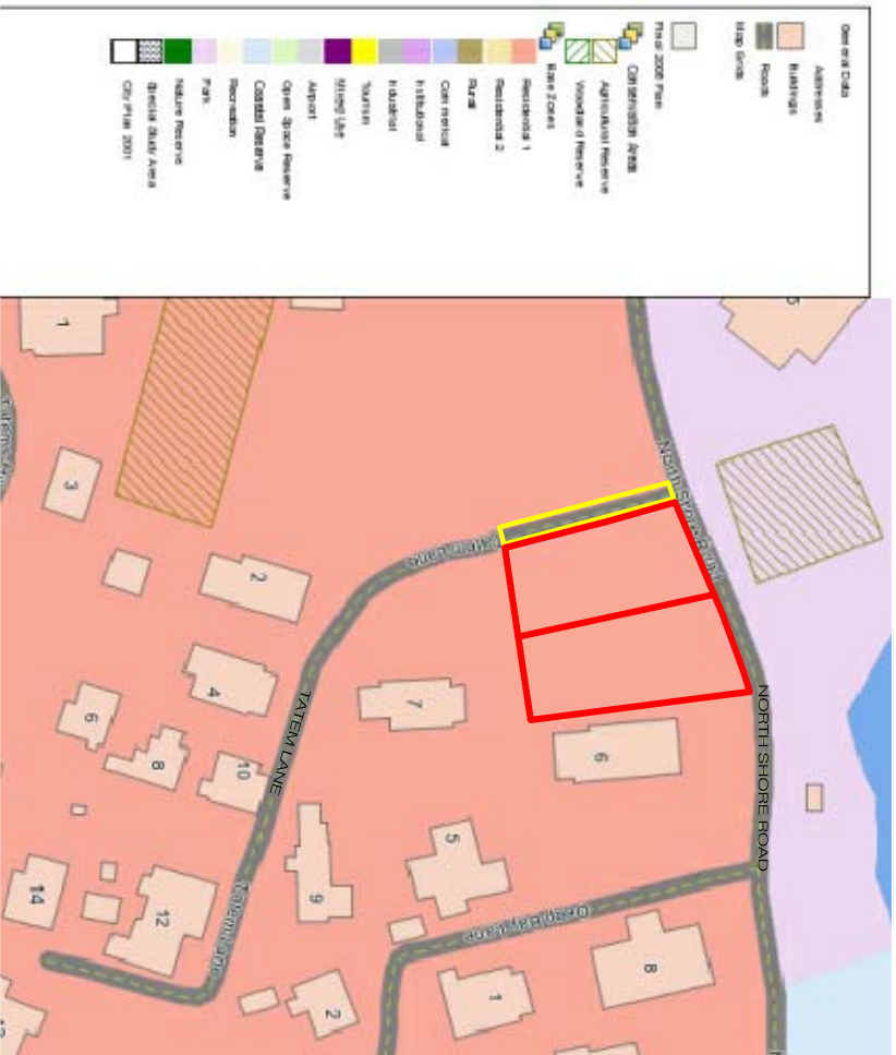
1 LOCATION PLAN NTS