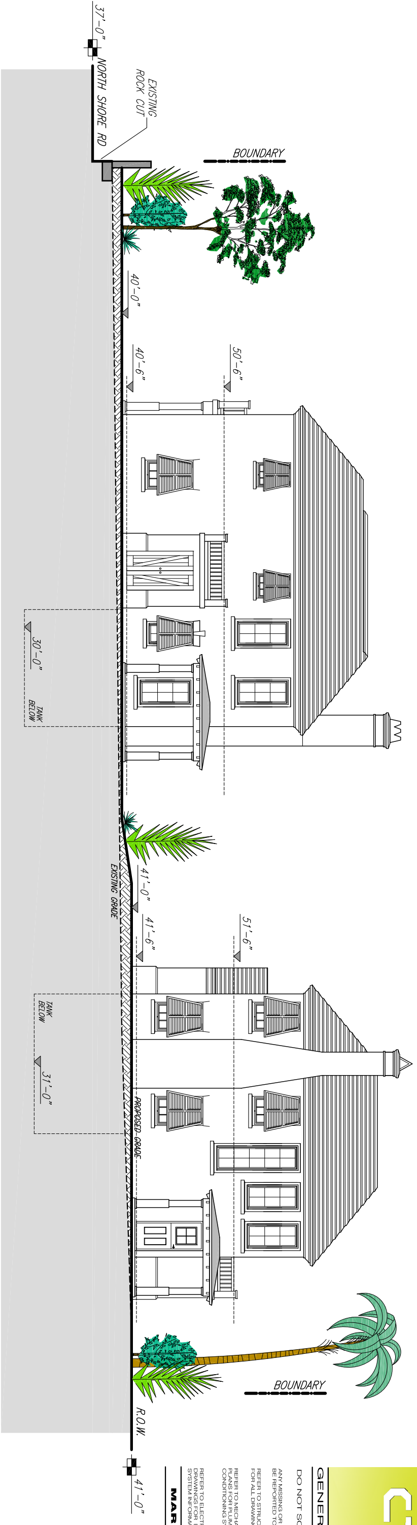
3 1/4" = 1' 1/8" HIGH SCALE 24x36 1/8" HIGH SCALE